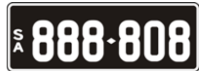
Lot 12 - SA Numeric Number Plate 888 808 Plate Size: 371 x 134mm Price sold $ _____