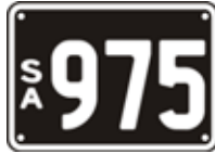
Lot 2 - SA Numeric Number Plate 975 Plate Size: 190 x 134mm Price sold $ _____