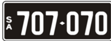
Lot 14 - SA Numeric Number Plate 707 070 Plate Size: 371 x 134mm Price sold $ _____