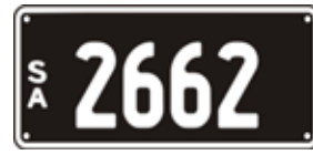
Lot 36 - SA Numeric Number Plate 2662 Plate Size: 315 x 134mm Price sold $ _____