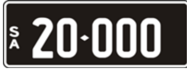
Lot 47 - SA Numeric Number Plate 20 000 Plate Size: 371 x 134mm Price sold $ _____