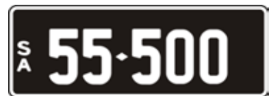
Lot 30 - SA Numeric Number Plate 55 500 Plate Size: 371 x 134mm Price sold $ _____