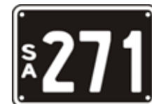
Lot 60 - SA Numeric Number Plate 271 Plate Size: 190 x 134mm Price sold $ _____