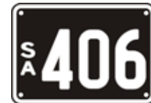
Lot 57 - SA Numeric Number Plate 406 Plate Size: 190 x 134mm Price sold $ _____