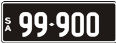
Lot 7 - SA Numeric Number Plate 99 900 Plate Size: 371 x 134mm Price sold $ _____