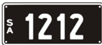
Lot 53 - SA Numeric Number Plate 1212 Plate Size: 315 x 134mm Price sold $ _____