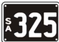
Lot 59 - SA Numeric Number Plate 325 Plate Size: 190 x 134mm Price sold $ _____