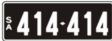
Lot 26 - SA Numeric Number Plate 414 414 Plate Size: 371 x 134mm Price sold $ _____