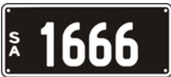
Lot 52 - SA Numeric Number Plate 1666 Plate Size: 315 x 134mm Price sold $ _____