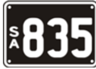
Lot 23 - SA Numeric Number Plate 835 Plate Size: 190 x 134mm Price sold $ _____