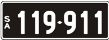
Lot 43 - SA Numeric Number Plate 119 911 Plate Size: 371 x 134mm Price sold $ _____