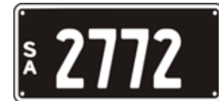
Lot 21 - SA Numeric Number Plate 2772 Plate Size: 315 x 134mm Price sold $ _____