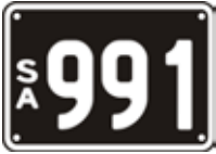
Lot 1 - SA Numeric Number Plate 991 Plate Size: 190 x 134mm Price sold $ _____