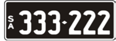
Lot 27 - SA Numeric Number Plate 333 222 Plate Size: 371 x 134mm Price sold $ _____