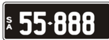
Lot 29 - SA Numeric Number Plate 55 888 Plate Size: 371 x 134mm Price sold $ _____