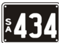
Lot 56 - SA Numeric Number Plate 434 Plate Size: 190 x 134mm Price sold $ _____