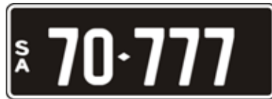
Lot 17 - SA Numeric Number Plate 70 777 Plate Size: 371 x 134mm Price sold $ _____