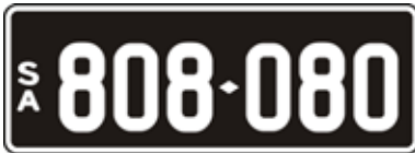
Lot 13 - SA Numeric Number Plate 808 080 Plate Size: 371 x 134mm Price sold $ _____