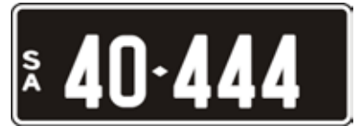
Lot 33 - SA Numeric Number Plate 40 444 Plate Size: 371 x 134mm Price sold $ _____