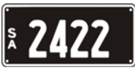
Lot 37 - SA Numeric Number Plate 2422 Plate Size: 315 x 134mm Price sold $ _____