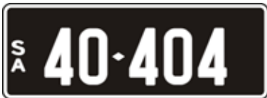
Lot 34 - SA Numeric Number Plate 40 404 Plate Size: 371 x 134mm Price sold $ _____