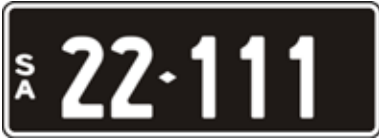
Lot 46 - SA Numeric Number Plate 22 111 Plate Size: 371 x 134mm Price sold $ _____