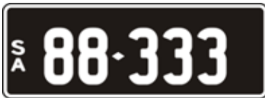
Lot 16 - SA Numeric Number Plate 88 333 Plate Size: 371 x 134mm Price sold $ _____