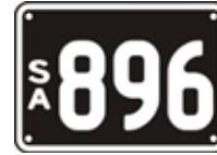
Lot 3 - SA Numeric Number Plate 896 Plate Size: 190 x 134mm Price sold $ _____