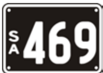
Lot 55 - SA Numeric Number Plate 469 Plate Size: 190 x 134mm Price sold $ _____