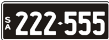
Lot 31 - SA Numeric Number Plate 222 555 Plate Size: 371 x 134mm Price sold $ _____