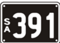
Lot 58 - SA Numeric Number Plate 391 Plate Size: 190 x 134mm Price sold $ _____