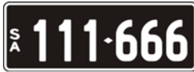
Lot 44 - SA Numeric Number Plate 111 666 Plate Size: 371 x 134mm Price sold $ _____