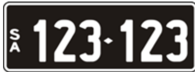
Lot 32 - SA Numeric Number Plate 123 123 Plate Size: 371 x 134mm Price sold $ _____