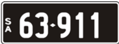
Lot 28 - SA Numeric Number Plate 63 911 Plate Size: 371 x 134mm Price sold $ _____