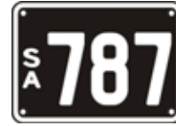
Lot 24 - SA Numeric Number Plate 787 Plate Size: 190 x 134mm Price sold $ _____