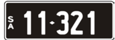
Lot 48 - SA Numeric Number Plate 11 321 Plate Size: 371 x 134mm Price sold $ _____