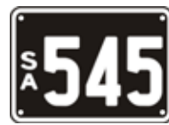
Lot 41 - SA Numeric Number Plate 545 Plate Size: 190 x 134mm Price sold $ _____