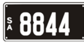
Lot 38 - SA Numeric Number Plate 8844 Plate Size: 315 x 134mm Price sold $ _____