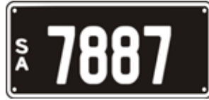
Lot 5 - SA Numeric Number Plate 7887 Plate Size: 315 x 134mm Price sold $ _____