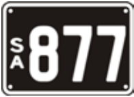
Lot 22 - SA Numeric Number Plate 877 Plate Size: 190 x 134mm Price sold $ _____