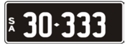
Lot 45 - SA Numeric Number Plate 30 333 Plate Size: 371 x 134mm Price sold $ _____