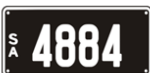
Lot 19 - SA Numeric Number Plate 4884 Plate Size: 315 x 134mm Price sold $ _____