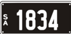
Lot 50 - SA Numeric Number Plate 1834 Plate Size: 315 x 134mm Price sold $ _____