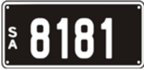
Lot 4 - SA Numeric Number Plate 8181 Plate Size: 315 x 134mm Price sold $ _____