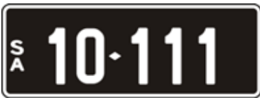
Lot 49 - SA Numeric Number Plate 10 111 Plate Size: 371 x 134mm Price sold $ _____