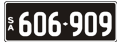
Lot 15 - SA Numeric Number Plate 606 909 Plate Size: 371 x 134mm Price sold $ _____