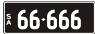
Lot 18 - SA Numeric Number Plate 66 666 Plate Size: 371 x 134mm Price sold $ _____