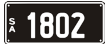
Lot 51 - SA Numeric Number Plate 1802 Plate Size: 315 x 134mm Price sold $ _____