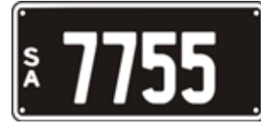
Lot 6 - SA Numeric Number Plate 7755 Plate Size: 315 x 134mm Price sold $ _____