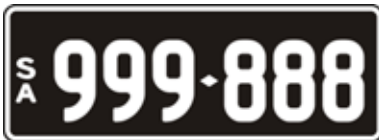
Lot 10 - SA Numeric Number Plate 999 888 Plate Size: 371 x 134mm Price sold $ _____