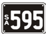
Lot 40 - SA Numeric Number Plate 595 Plate Size: 190 x 134mm Price sold $ _____