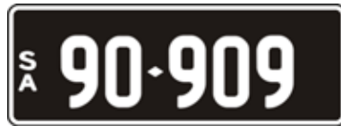
Lot 8 - SA Numeric Number Plate 90 909 Plate Size: 371 x 134mm Price sold $ _____