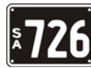
Lot 39 - SA Numeric Number Plate 726 Plate Size: 190 x 134mm Price sold $ _____