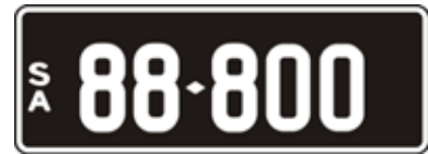
Lot 9 - SA Numeric Number Plate 88 800 Plate Size: 371 x 134mm Price sold $ _____