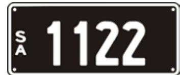
Lot 54 - SA Numeric Number Plate 1122 Plate Size: 315 x 134mm Price sold $ _____