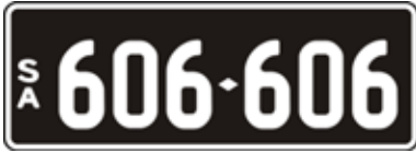
Lot 25 - SA Numeric Number Plate 606 606 Plate Size: 371 x 134mm Price sold $ _____