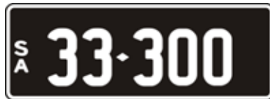
Lot 35 - SA Numeric Number Plate 33 300 Plate Size: 371 x 134mm Price sold $ _____