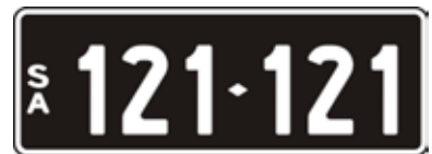
Lot 42 - SA Numeric Number Plate 121 121 Plate Size: 371 x 134mm Price sold $ _____