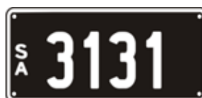
Lot 20 - SA Numeric Number Plate 3131 Plate Size: 315 x 134mm Price sold $ _____